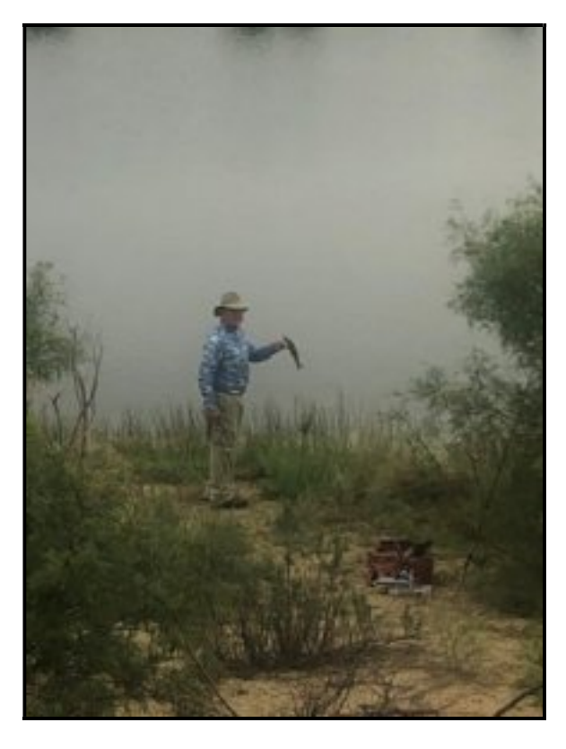
Buda Methodist Men's Retreat